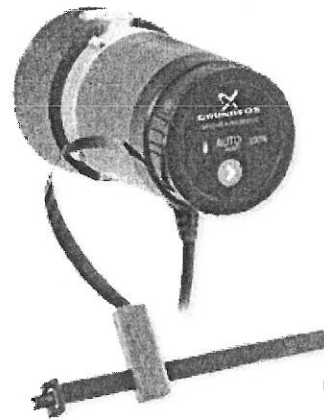
COMFORT PM AUTO UP 10-16 A PM BN5/LC AUTOADAPT™ and line cord